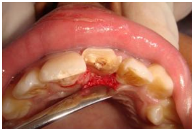
Figure 5: Palatal flap reflected under local anesthesia.

was extending till cemento-enamel junction. Electrical pulp testing displayed a positive pulp response.