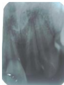
Figure 2: Diagnostic IOPA showing crown fractured tooth with pulp involvement n root intact

Clinical examination showed the subgingival complicated fracture of permanent left central incisor. The fracture was in horizontal fashion exposing the pulp chamber (Ellis Class III) (fig. 1). The tooth was not mobile and the surrounding structures showed no disturbance. The tooth fragment was retained attached to the tooth only with the support of soft tissue.