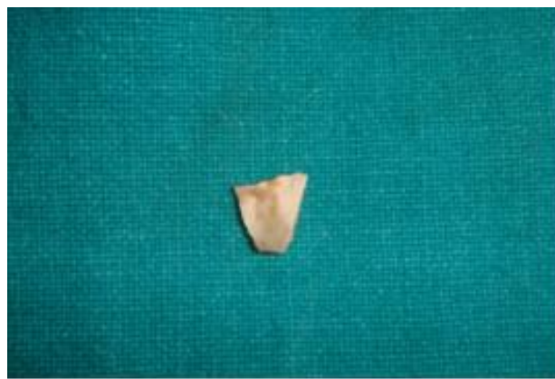
Figure 3: Preserved fractured fragment