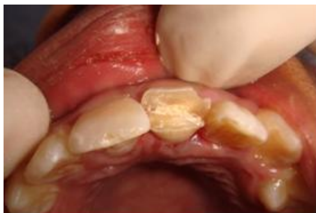
Figure 6: Fragment reattached using flowable Compomer restorative cement

At first visit, after administering the local anesthesia the fractured fragment was removed (figure 3). The fragment was cleaned with normal saline and stored in the same. The pulp was extirpated followed by thorough irrigation. Preceding the bio-mechanical preparation the canal was obturated with gutta-percha using lateral condensation technique (figure 4). The access cavity was restored with glass-ionomer cement restoration taking care not to interfere with the fragment reattachment.