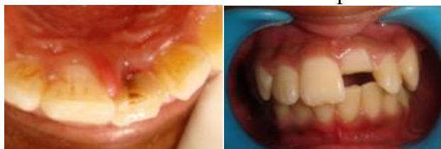
Figure 1: Preoperative photograph showing subgingival crown fracture (Ellis class III)

The patient’s medical history revealed no contributory factors. The trauma had occurred 15 days back due to fall while working in the farm and that no treatment had been performed.