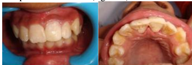
Figure 7: Tooth restored with composite restoration

agent was applied to the tooth surface and then the fragment was reattached using flowable Compomer restorative cement (figure 6). The rest of the tooth portion was restored with composite restoration (figure 7).